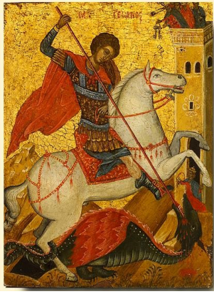
Troparion to St. George

As the deliverer of captives and defender of the poor, healer of the infirm and champion of kings, victorious great martyr George intercede with Christ our God for our souls salvation.